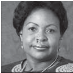
MAITE NKOANA- MASHABANE

Maite Nkoana-Mashabane was born in Ga-Makanye village in the Limpopo Province. During the 1980s, she was an active member of the United Democratic Front (UDF) and served in the various structures of the Mass Democratic Movement (MDM) and the ANC underground. After the unbanning of the ANC in 1990, she actively participated in the re-launch of the ANC Women's League in the country, was the Chairperson in Limpopo between 1992 and 1995, and also served as a member of the League's National Working Committee.